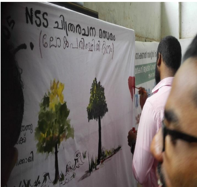
Canvas Painting for Students & Faculties