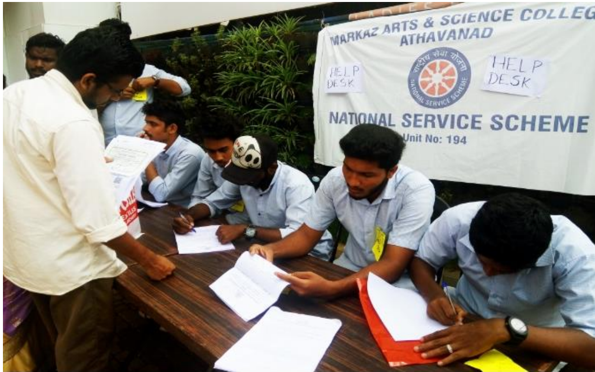
Ration Card help desk by NSS volunteers in Valanchery Municipality