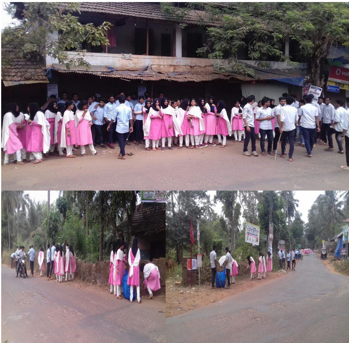
NSS Volunteers cleaning the Town area (Chungam) as a part of Swachh Bharat mission

Campus cleaning activities were conducted once in a month as a part of the Swachh Bharat Mission and at the direction of the University NSS Department. As a part of this, Cleaning was conducted at the chungam town near to the Markaz campus. Also herbal gardening, classroom cleaning, cleaning premises were carried out by the collective effort of the NSS volunteers.