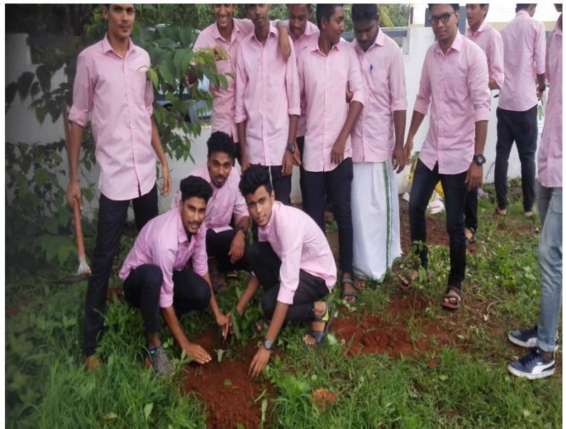
NSS Volunteers Planting the Saplings