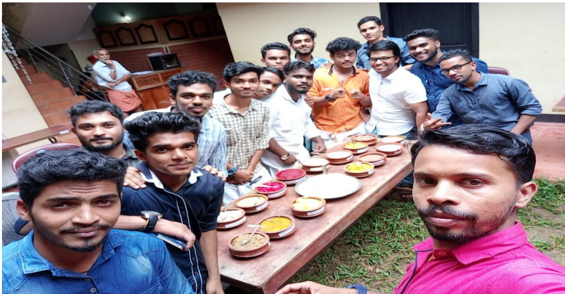
STUDENTS AND PO WITH THE ITEMS COOKED WITHOUT ANY PRESERVATIVES

NSS Volunteers visited Nature Hygeine camp at Tirur Prakrithi Gramam on ..... Students were given about the preservatives and colouring agents used in food items. Students prepared the lunch along with the staffs of Camp without any preservatives or chemicals. Different variety of food items were prepared and students got excited with the ideology used to maintain such food habits.