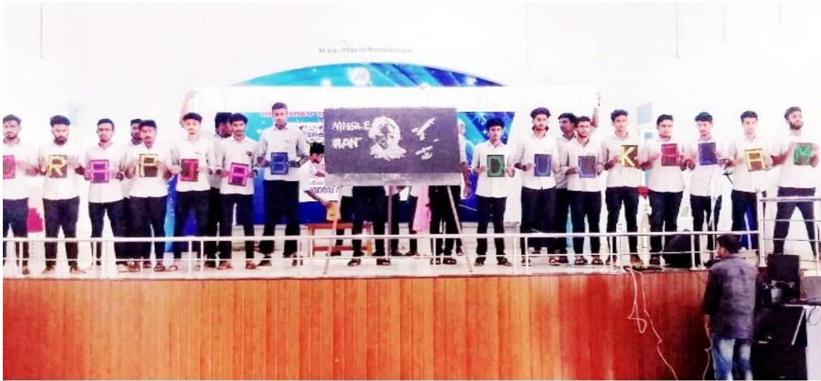
A Tribute to Dr. APJ Abdul Kalam by Markaz NSS team