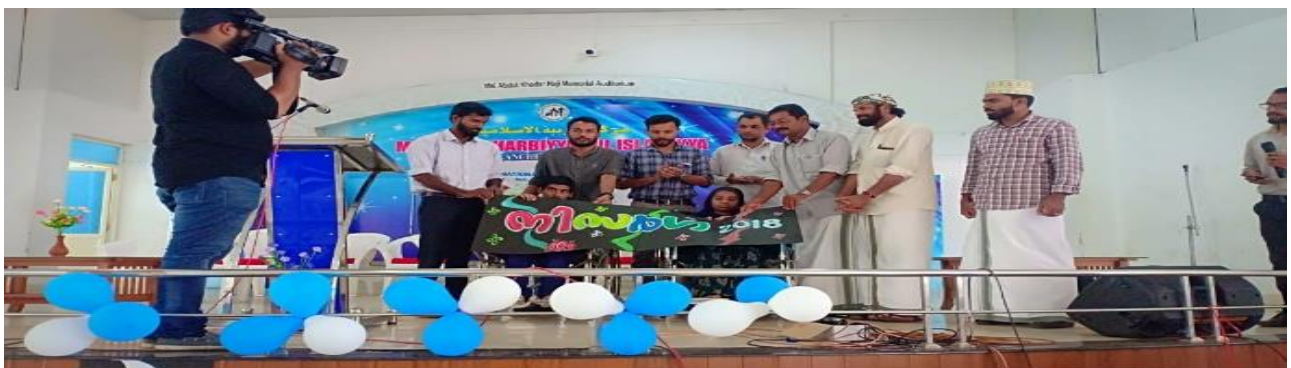
Inuaguration of Ponnani cluster NSS Arts fest 'NISARGA-2018' at Markaz Arts and Science College, Athavanad