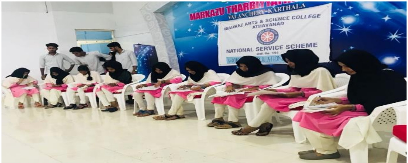
Participant's of Quiz programme conducted by NSS volunteers on behalf of World population day