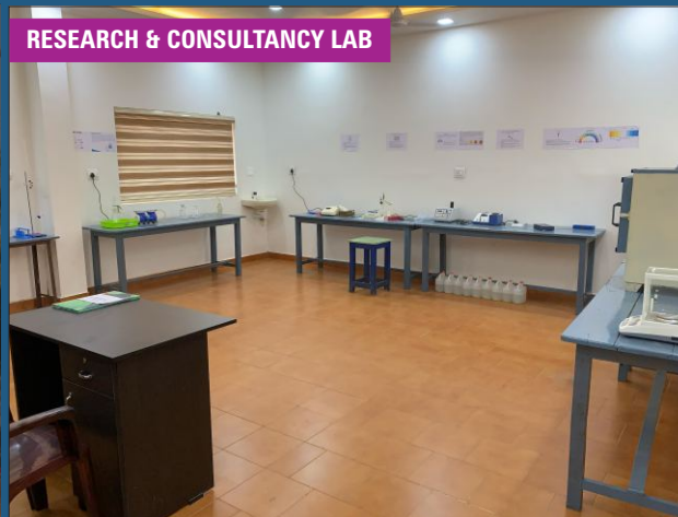
RESEARCH & CONSULTANCY LAB