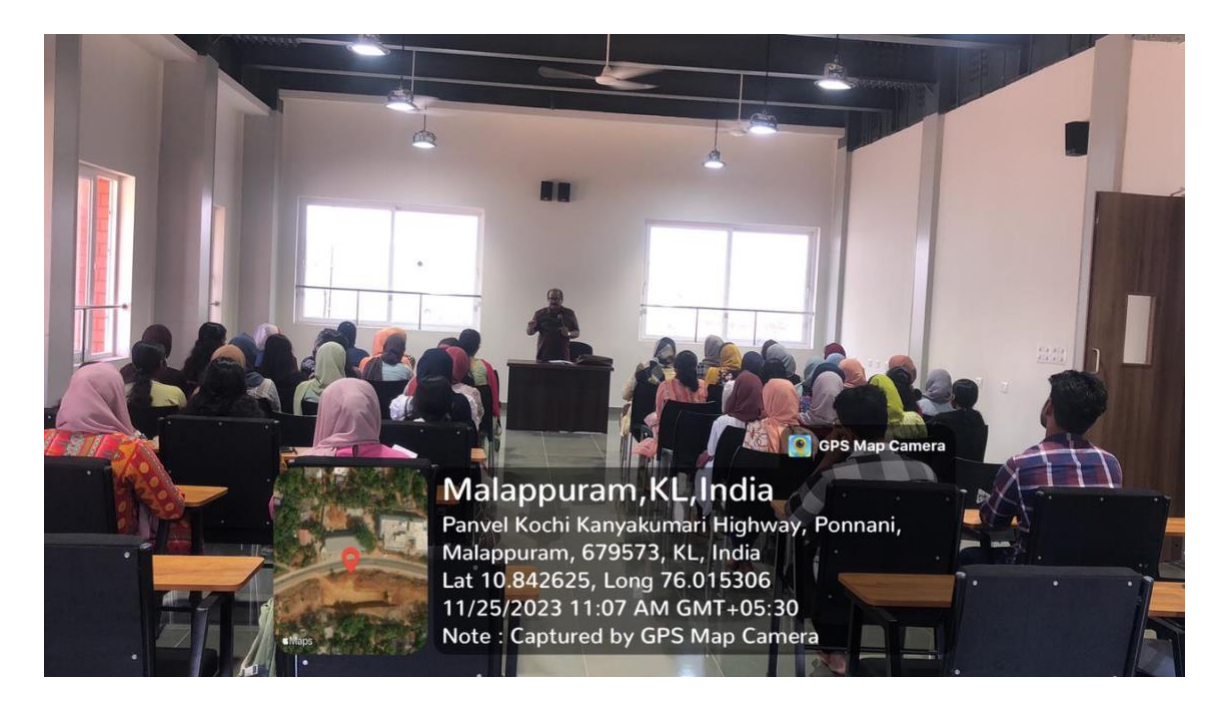
Geotag photos of the Programme