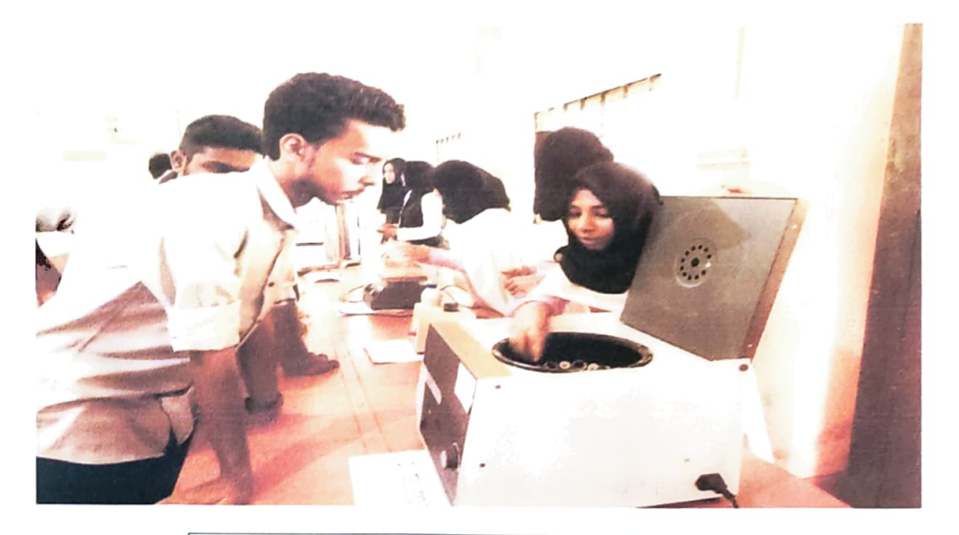
Open House Exhibition 2019 - Stalls by departments