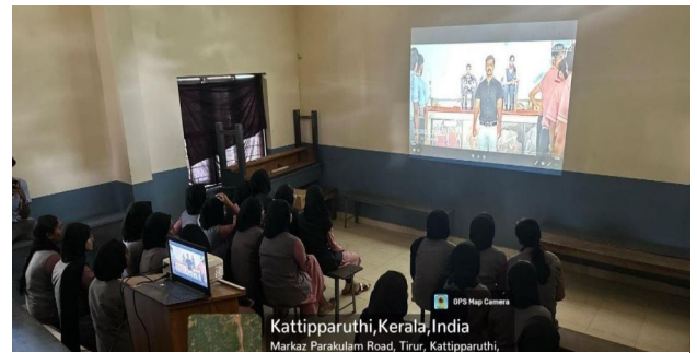
Short film screening organized for public and students