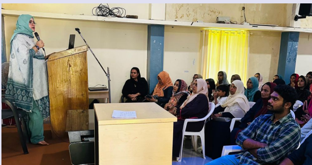
Showcasing of institution in the PTA meeting

Annual meeting of PTA organized at the beginning of the academic year for showcasing of the institution and explaining COs and POs. Department level meetings were conducted at the end of each semester in connection with internal assessment. In addition, Scholarships were given to meritorious students.