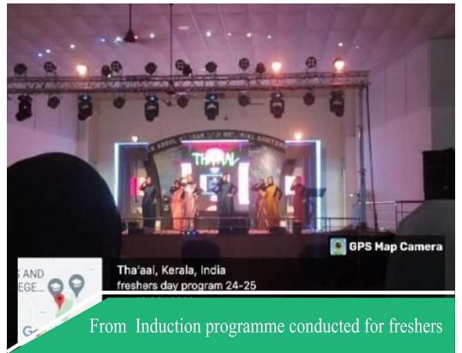
From Induction programme conducted for freshers