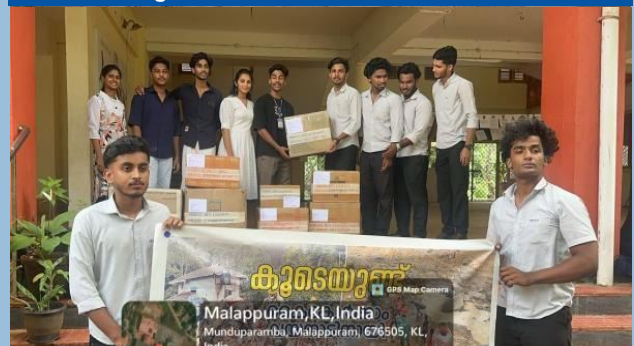
From fund collection for Wayanad land slide victims