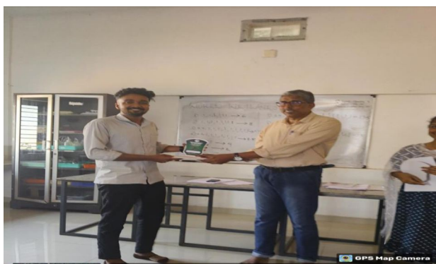
Prize distribution to winners of Quiz competition

Department organized World Wetlands Day celebration on 3 rd February 2025