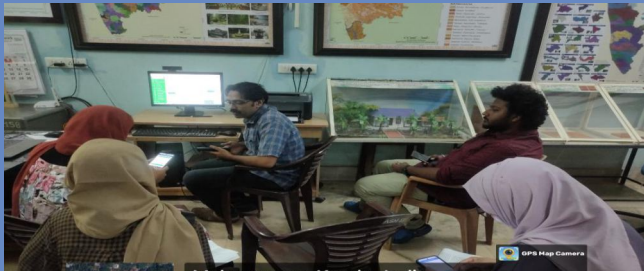
Volunteers interacting with District Level officers at Civil Station, Malappuram

Five members of our club participated in 'Quality connect campaign' on the occasion of World Consumer Rights Day-15 th March 2025, organized by Bureau of Indian Standards. The Manak Mitras (volunteers) interacted with a minimum of 10 district level officers, in various departments of Collectorate, for creating awareness on BIS and their importance.