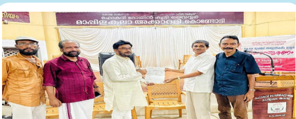
Memorandum of understanding signed between Markaz College & Mahakavi Moyin Kutty Vaidyar Mappila Kala Academy, Dept of Culture, Govt of Kerala