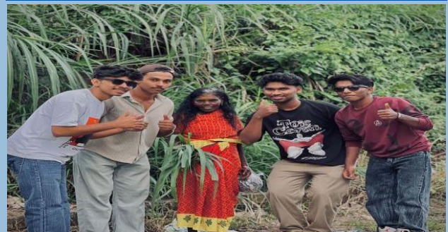
Volunteers in a two day residential camp at Attappadi tribals village