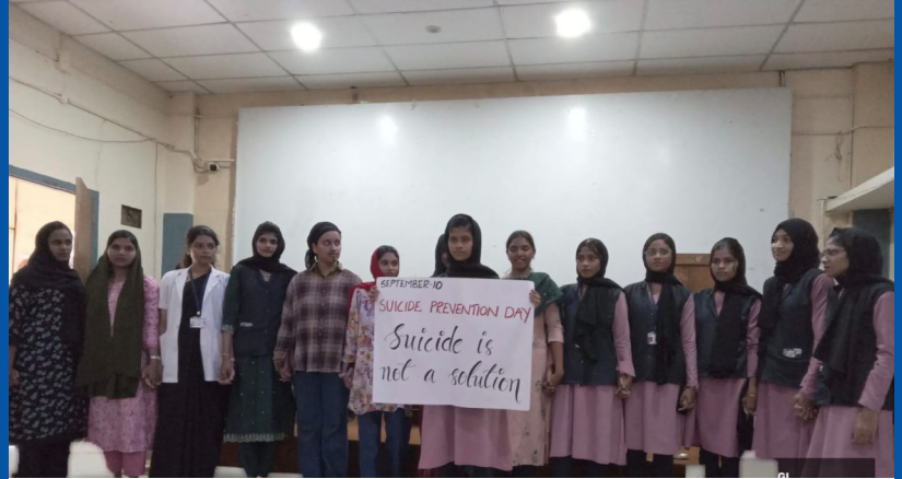
From Drama on World Suicide Prevention Day