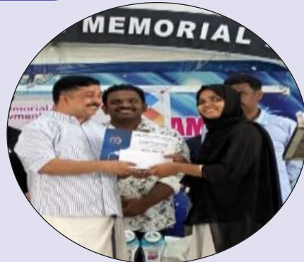
Distribution of Murshid Memorial Excellence Endowment Award