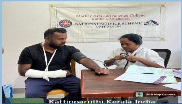
From two day free kidney disease detection camp