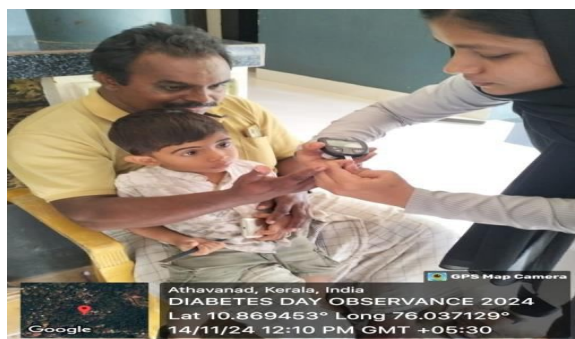
From World Diabetic Day outreach programme