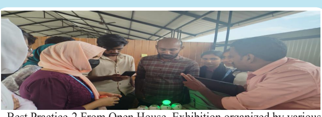
Best Practice-2 From Open House Exhibition organized by various departments for students and public