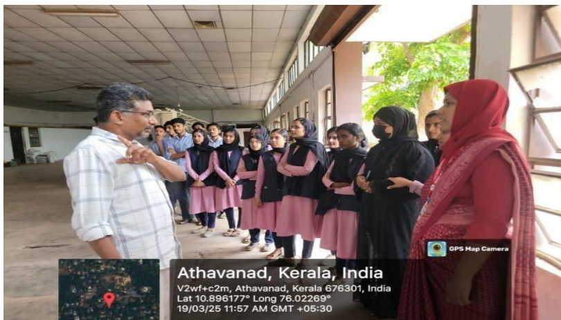
Industrial visit to Changampally Arya Vaidyashala