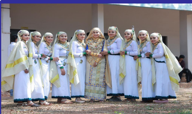
College Oppana team secured 'A' grade in Calicut University C-Zone

organized a joyful Christmas celebration on 23 rd December 2023, featuring decorations, carols, and cultural programs. On 30 th January 2025, a blood donation camp was conducted in collaboration with the Health and Wellness Club and Tirur BDK, where 29 students donated blood, reflecting the college's dedication to community service. The Annual Sports Meet, Khelo Markaz, held on 5 th February 2025, included events like badminton, football, and throwball, promoting sportsmanship and unity. This was followed by the Chuvadhu Fine Arts Festival on 25 th February 2025, which showcased a wide range of on-stage and off-stage competitions, celebrating student creativity. The year's activities concluded with 'Kalaash', the College Day celebration on 27 th February 2025, featuring vibrant performances and a cultural music event by Culture Hood, marking a lively end to an eventful and successful academic year.