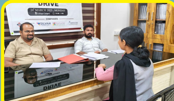
From Pool Campus Recruitment Drive conducted in the campus on 24 th March 2025