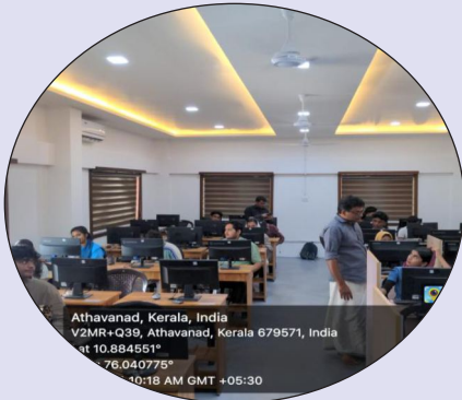
Aptitude Test conducted in the Computer lab by ILA Foundation ,an NGO ,for orphan students