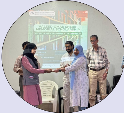
Distribution of Valeed Omar Sherif Memorial Scholarship