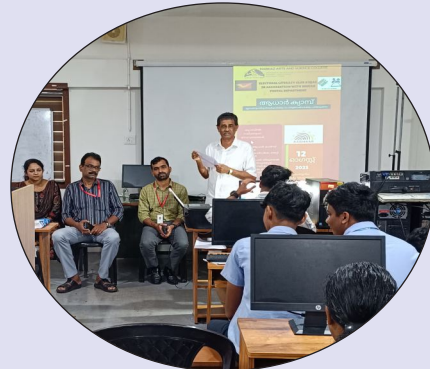
From Adhar enrolment camp organized in association with Tirur Postal Circle for students and locals