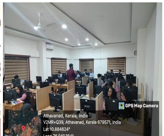
Workshop on Income Tax and GST